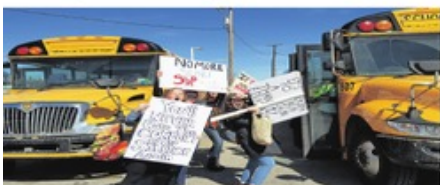
JEFF HAWKES/STAFF WRITER

Teens from county attend DC 'March for Our Lives' rally calling for gun control